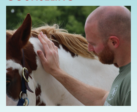
SPEECH & LANGUAGE PATHOLOGY