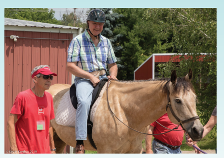
Integrated therapies for age related special needs.