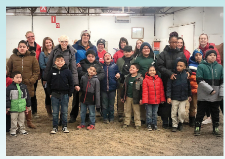
Experiences and activities for urban youth