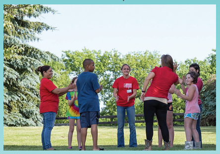
Crisis intervention & long term therapies for under served families.