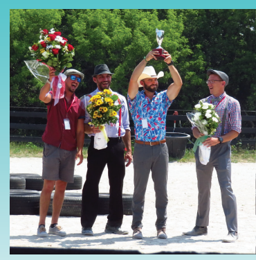
Triple Crown Winners The Bartenders